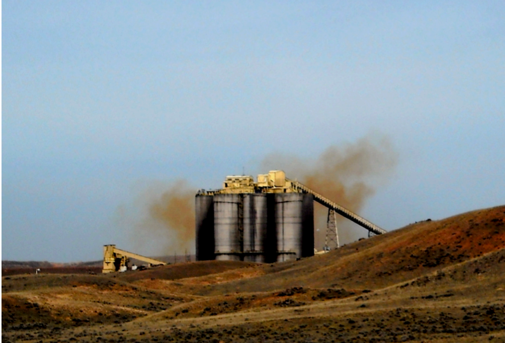
Orange Cloud at Black Thunder Coal Mine in Powder River Basin, Campbell County, Wyoming. Picture Taken April 11, 2010.

When orange clouds are produced, they reflect significant levels of nitrogen dioxide. OSM has noted that concentrations of nitrogen dioxide in orange clouds can be as high as 30 ppm, or 30,000 ppb. See Exhibit 5, OSM 2000 Wyoming Evaluation at 5. The threshold at which nitrogen dioxide concentrations become visible is considered to be 2.5 ppm, or 2,500 ppb, are visible. See Exhibit 7, Coal Mine Workers Fact Sheet. This represents concentrations twenty-five times higher than the current 1-hour NAAQS for nitrogen dioxide. In other words, visible orange clouds represent nitrogen dioxide levels that far exceed the NAAQS, clearly threatening public health.