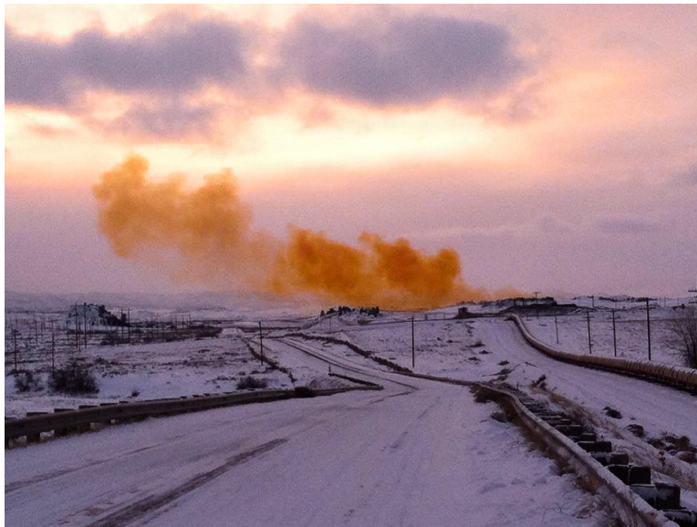
Toxic Orange Cloud Produced from Blasting at Rosebud Coal Mine, Rosebud County, MT. Picture Taken February 2014.

Too often, blasting at coal mines leads to the production of dangerous levels of nitrogen dioxide emissions, which are seen as orange to red clouds. See Image Below. These clouds of toxic gas represent significant threats to public health and welfare and must be curtailed to prevent injuries to persons as required by SMCRA. OSM has itself recognized the serious threats posed to persons from nitrogen oxide emissions produced as a result of blasting.