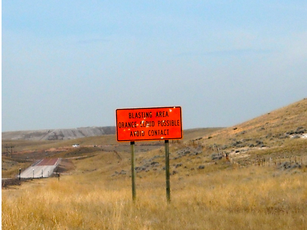
Sign on Wyoming Highway 450, Near Black Thunder Coal Mine, Warning the Public to Avoid Contact with Orange Clouds. Picture Taken April 11, 2010.

It is possible to prevent the production of orange clouds when blasting at coal mines. According to the BLM, the most “successful control measure” is to “reduc[e] the size of the cast blasting shots.” Exhibit 6, Wright Area FEIS at 3-89. Other means of eliminating nitrogen oxide emissions include “working with blasting agent manufacturers to reduce NOx emissions by the use of different blasting agents, different blends of blasting agents, different additives, different initiation systems and sequencing, [and] borehole liners[.]” Id. At the North Antelope Rochelle mine in the Powder River Basin, the BLM reports the operator has eliminated “NOx in over 75 percent of their cast blasting through the use of borehole liners and changing their blasting agent blends.” Id.