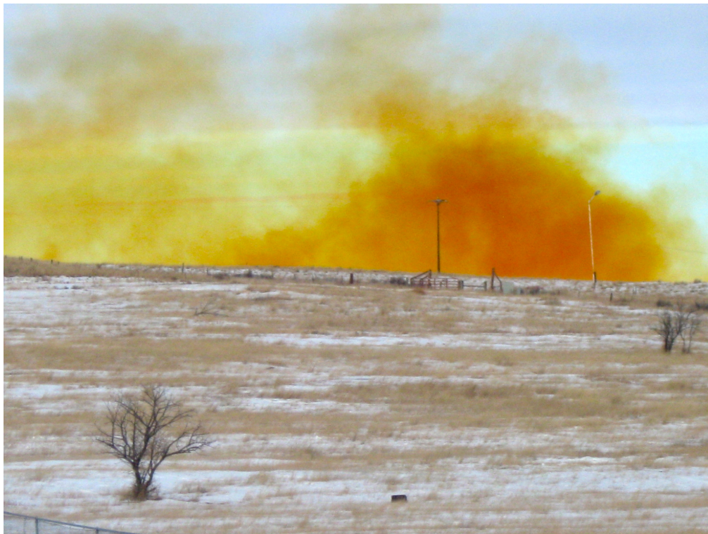
Orange Cloud at Rawhide Coal Mine in Powder River Basin, Campbell County, Wyoming. Picture Taken January 7, 2011.

Blasting that produces visible clouds, such as cast blasting, is often associated with surface coal mining operations. In the Powder River Basin of northeastern Wyoming and southeastern Montana, the largest coal producing region in the United States, orange clouds are a frequent occurrence at the region’s surface mines. 9 See Images below. Recent news articles have explained that 95% of cast blasting in the Powder River Basin produced orange clouds. See Exhibit 9, Sukhomlinova Cockar, A., “Cast blast creates a cloud,” Gillette News Record (Jan. 4, 2013). However, it has been noted that conventional blasting (i.e., not cast blasting) can also produce orange clouds in the Powder River Basin.