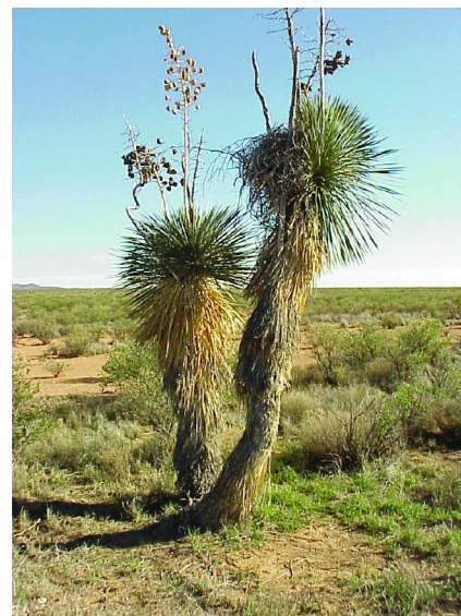
Figure 3. This Aplomado Falcon nest was in a Soaptree Yucca in Luna County, New Mexico; three young successfully fledged from this nest in July 2002.

In adjacent Chihuahua, documentation of breeding Aplomado Falcons plus other recent sightings, together with recent findings in New Mexico, indicate the existence of a population along the border serving as a source for further colonization into historic range in New Mexico, Arizona, and western Texas. Based on this and other recent studies, falcons in northern Chihuahua and southern New Mexico