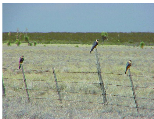
Figure 4. These are three of a five-member Aplomado falcon family in Luna County, New Mexico, photographed 11 September 2002. This breeding event established the first successful U.S. nesting by naturally occurring Aplomado Falcons in 50 years.

Following the last known nest in 1952, no additional Aplomado Falcons were reported in that decade in New Mexico. During the subsequent three decades, reports of falcons were few and widely scattered and amounted to two reports in the 1960s and four reports each in the 1970s and 1980s (Figure 1, Table 2); none was confirmed with photographs or other tangible evidence, but together they implied a continuing, albeit low, level of occurrence during those decades. That changed, however, when single Aplomado Falcons were photographed near Tularosa, Otero County 25 June 1991 (Williams and Hubbard 1991) and near Bingham, Socorro County 14 August 1992 (Williams 1993). As the 1990s progressed, an increased presence of Aplomado Falcons became apparent; in all, the decade produced 24 credible reports involving 26–31 falcons in southern New Mexico, with three to six observations occurring per year by the latter part of the decade. By 2000–2004, not only did the high frequency of sightings continue (Figure 1, Table 2), but pairs of birds