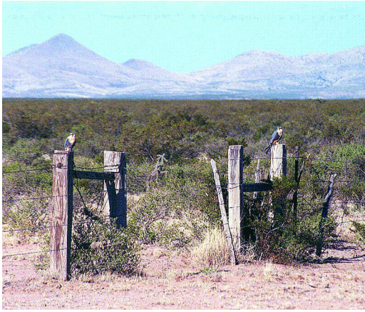
Figure 2. The Aplomado Falcon pair in Luna County, New Mexico 5 October 2000 was the first confirmed pair in the state since 1952.

in New Mexico or adjacent Chihuahua; no observations of Aplomado Falcons in New Mexico were of birds that were marked in Texas.