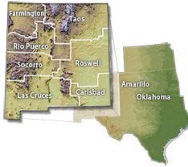
Figure 1. BLM Field Office Map for New Mexico.