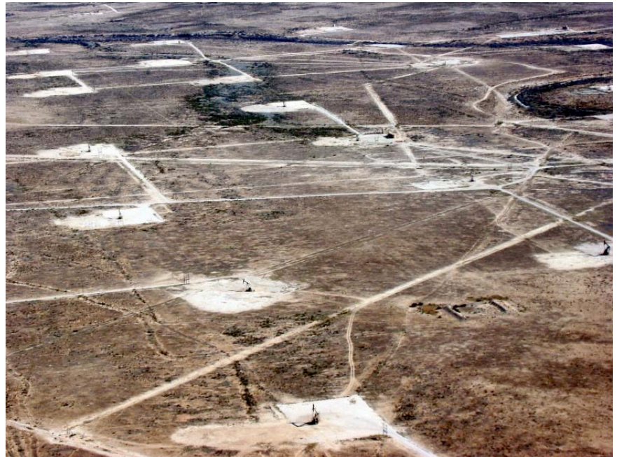
Figure 3. Aerial view of oil and gas infrastructure in the western Permian Basin of New Mexico.

Once abundant throughout their range in eastern New Mexico, the lesser prairie-chicken has been extirpated from 56% of its former range