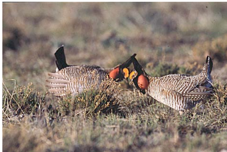
Figure 2. Male lesser prairie-chickens in ritual mating dance.

In 1997, Carlsbad adopted a Resource Management Plan Amendment (RMPA) authorizing oil and gas extraction under standard terms and conditions across 95% of the field office (comprising 2.2 million surface acres of public land and approximately 1.9 million acres of federal mineral estate). The RMPA included a timing stipulation on 460,700 acres, aimed at protecting Lesser Prairie-Chickens from disturbance during their spring mating season. 2 The timing limitation reads: