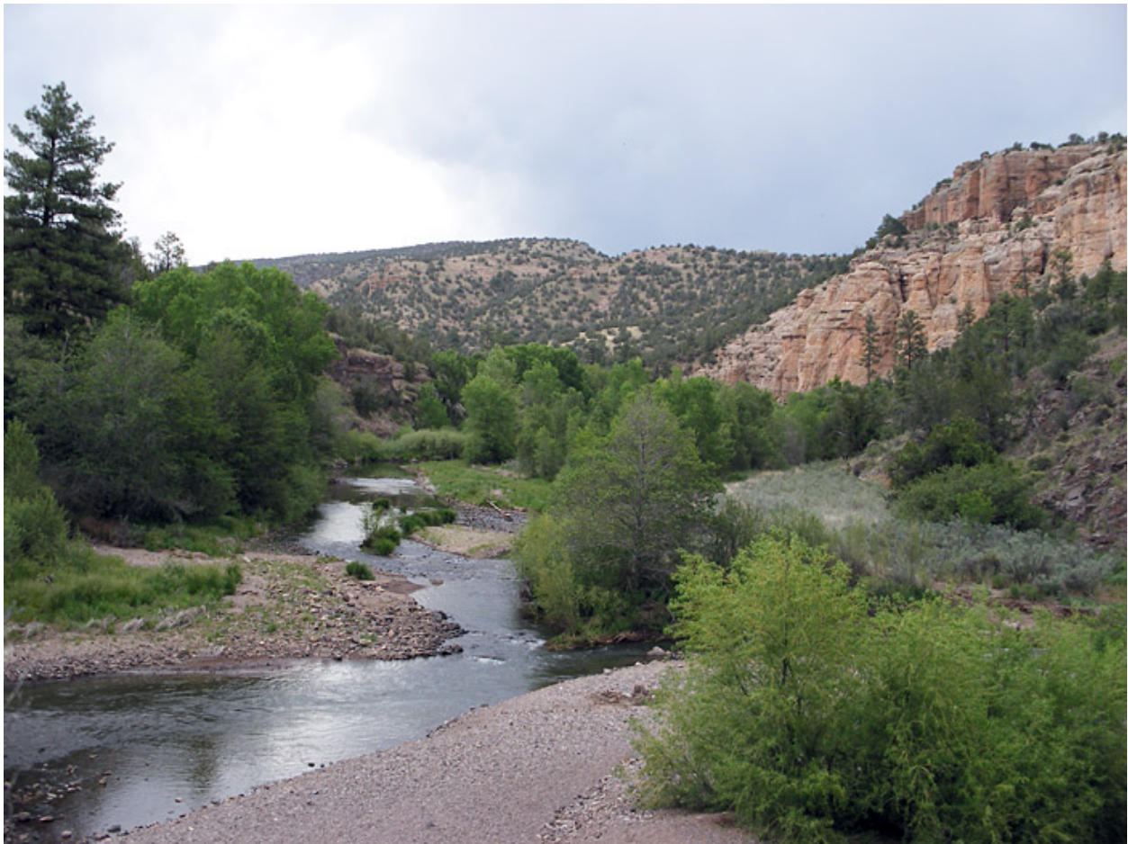
Junction of Main and East forks of the Gila River, the type locality for Lachlania dencyanna.